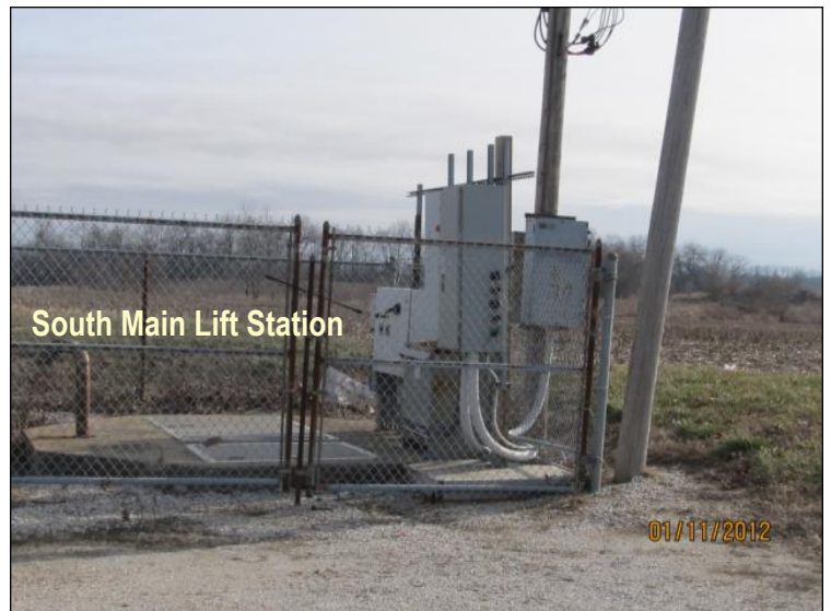
South Main Lift Station