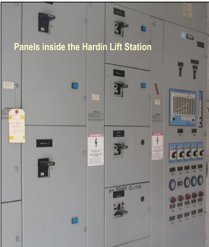
Panels inside the Hardin Lift Station