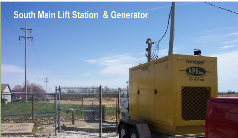
South Main Lift Station & Generator