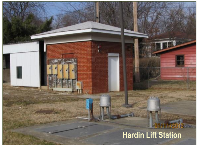
Hardin Lift Station